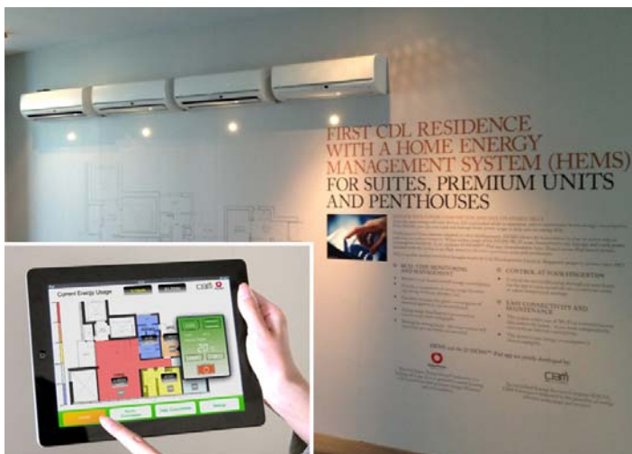
The D-HEMS installed in a demonstration model of the condominium