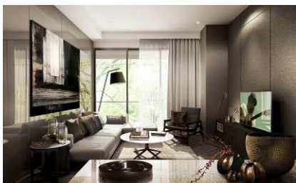
Living Room (Image)