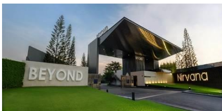
Entrance (Provisional) (Image)

An outdoor pool, park and sports gym will be available for shared use by residents.