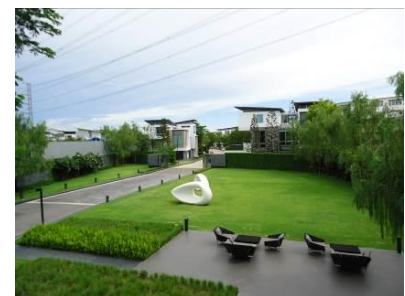
Park (Provisional) (Image)