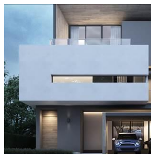
Appearance (Provisional) (Image)