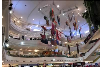
Interior of “The MALL” Department Store