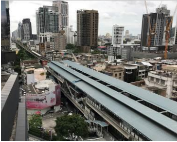
Area around Phrom Phong Station

This project is located seven minutes on foot (550 m) from Phrom Phong Station on the elevated railway (BTS) in the center of Bangkok. “The EmQuartier” and “The Emporium” High end department stores can be found in front of Phrom Phong Station. Moreover, there are many commercial facilities, the approximately 4.8 ha Benchasiri Park and an international school within 1 km. This is an area where many foreigners, including Japanese, live, and is a location with great convenience for living.