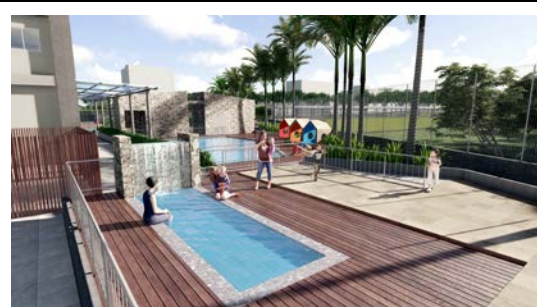
Outdoor kids' pool