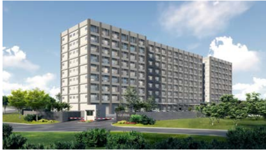
A view of the apartments from the north side