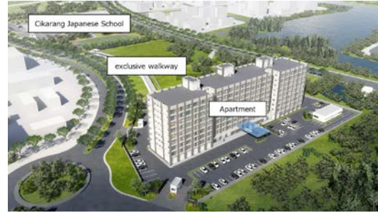
A view of the path to the Japanese school