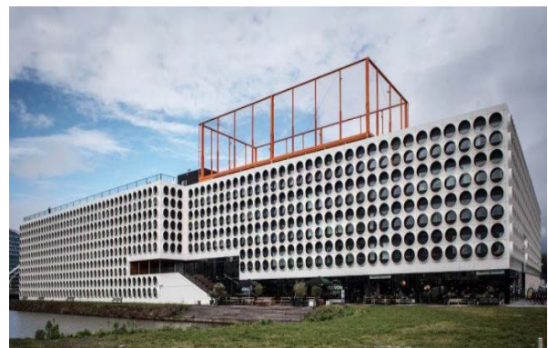
Examples of the Modular Building Products of Jan Snel