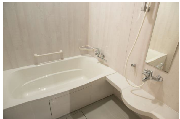
Unit bathroom made to Japanese specifications