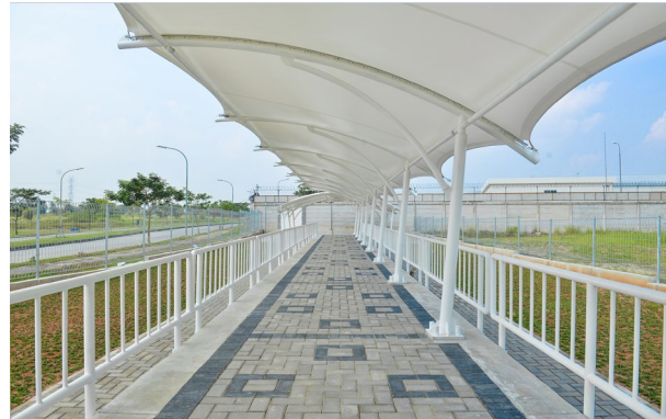
Dedicated school footpath (photo taken from the facility)