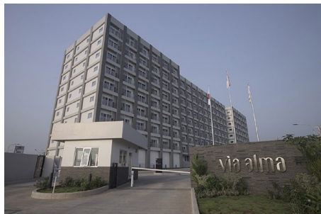
Exterior view of the apartments