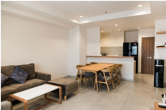
Interior view of an apartment