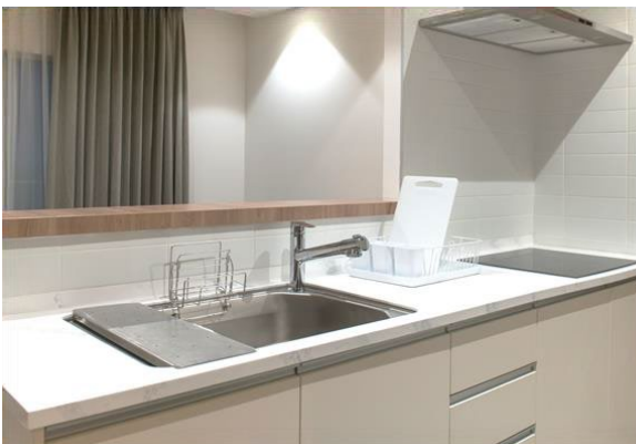
System kitchen made to Japanese specifications