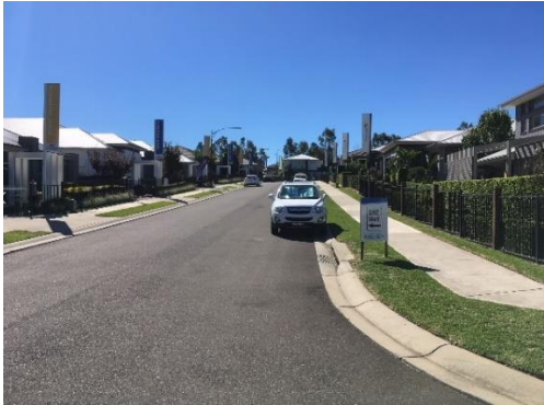
【Box Hill of the Future (nearby residential area) 】