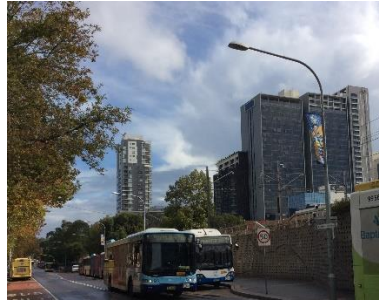
[Suburb of Parramatta]