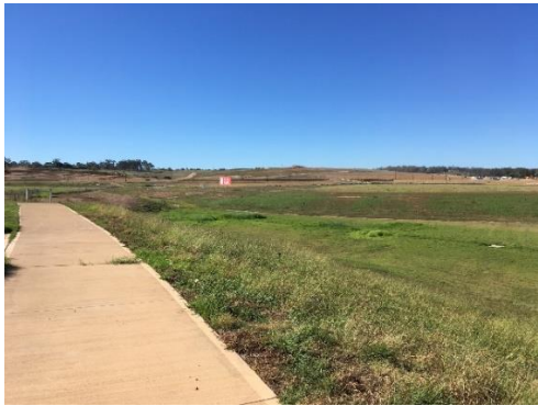
[Current view of Box Hill area]

In March of this year, the company completed construction work on multiple double tracks to fundamentally improve their transport network and solidify business infrastructure in the areas along their tracks. They also are engaging in promising markets in Japan and overseas as they work to capture new income streams and establish a growth cycle for the future. As part of their engagement in overseas markets, through this project the company will examine expanding their existing Group presence in Australia and also explore potential for business development in other areas overseas.