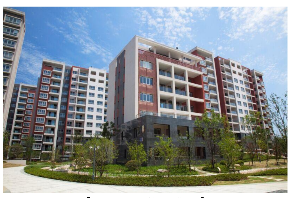
[Condominium in Moonlit Garden]