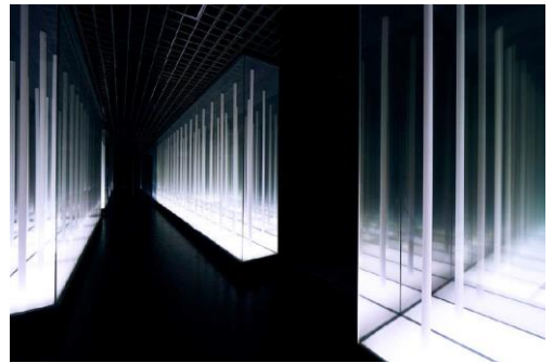
[Acrylic pipes reflecting in the reflective film]

An infinite bamboo forest was created with the effects of reflective film, and this provided a memorable space and feeling for visitors to the Sales Center. The showpiece was dismantled in November 2015 when properties were handed over to buyers.